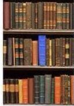
50 th percentile