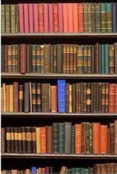
90 th percentile